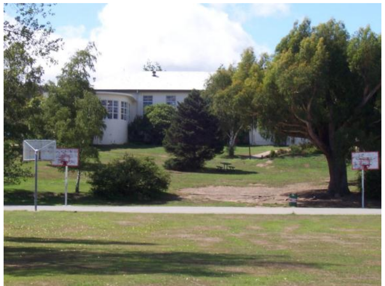
Many students and staff are stricken with winter ills at the moment.