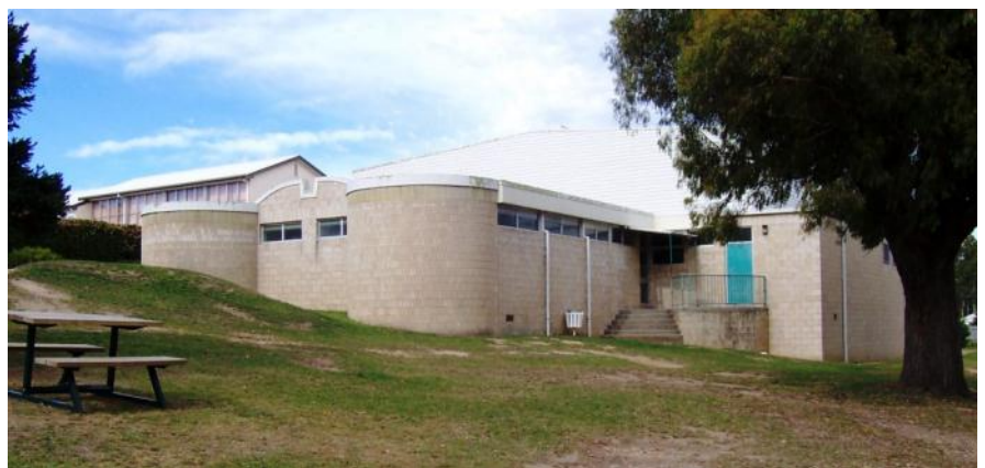
School grounds looking decidedly deserted this week due to illness.

Please note: Deadline for articles to be included in the next Valley Voice is: 5 pm Tuesday, August 14, 2007. New email address: judith.spilsbury@bigpond.com