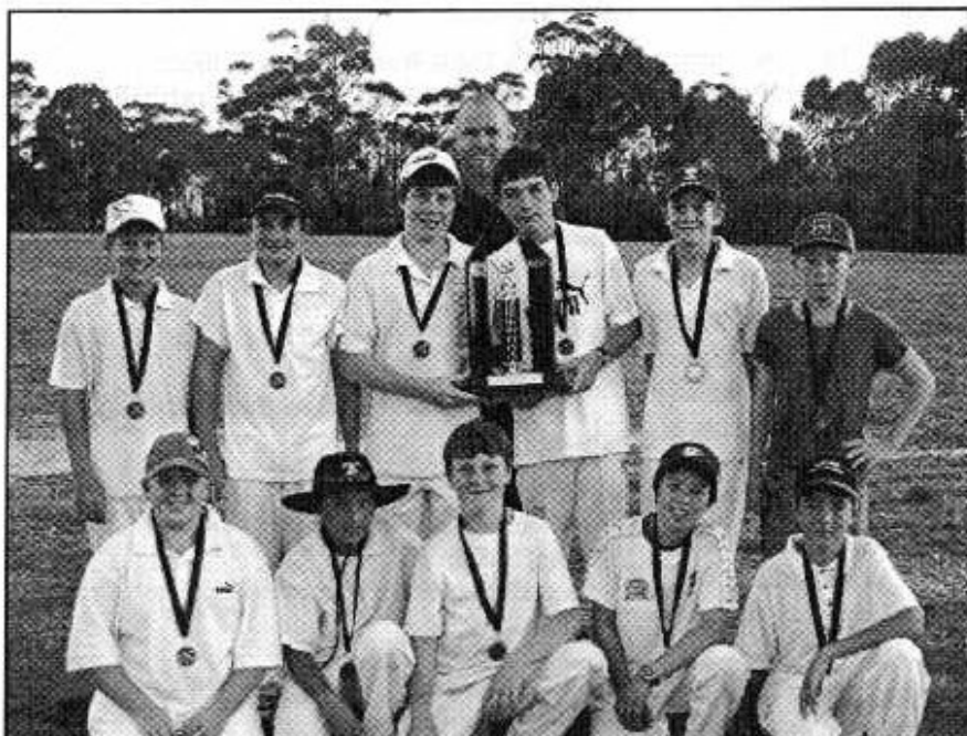
Pictured, left, is the St.Marys under 15 cricket team who defeated St.Helens in the East Coast Cricket Association Grand Final on Friday 23-02-07.

Please note: Letters to be published in the Valley Voice must be signed. Your name need not be published, but we must have a signature. Articles and letters published in the Valley Voice are not necessarily the opinion of the staff and volunteers of this community paper. Ed.